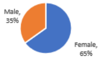
Lower Middle Quartile